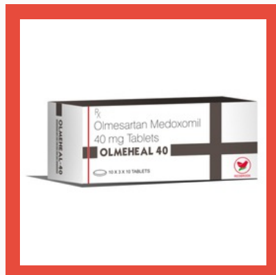
Olmesartan Medoxomil Tablets