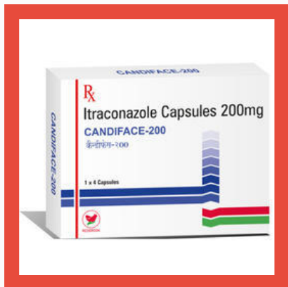
Itraconazole Capsule 200mg