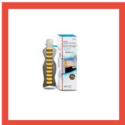
Slimtop Orlistat Capsules