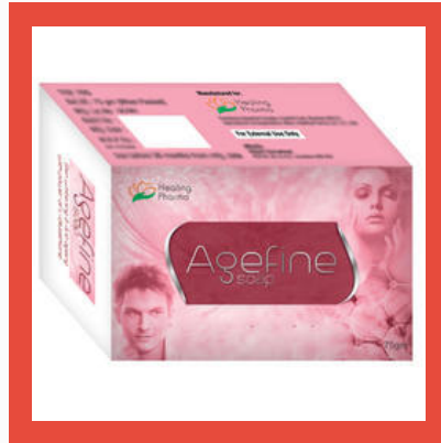
L- Glutathione Agefine Soap