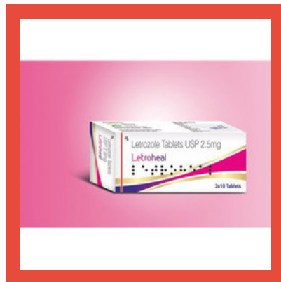
Letrozole Tablet USP