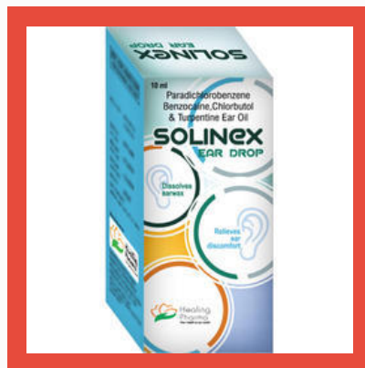
Benzocaine Chlorbutol & Turpentine Ear Oil