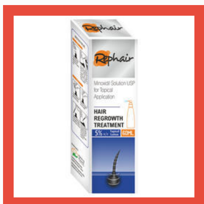
MINOXIDIL 5% Repair Spray