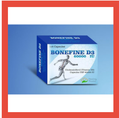
Cholecalciferol Vitamin D3 Capsules USP 60000 IU