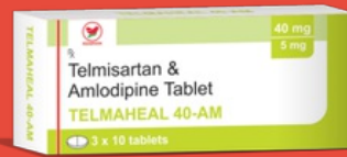
Telmaheal 40AM (Telmisartan Amlodipine)