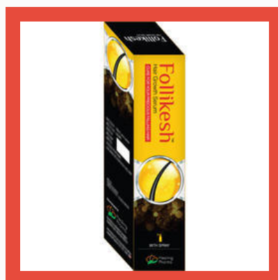
Follikesh Hair Fall Serum with Spray