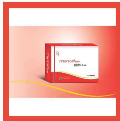
Itrotop 200 Capsule