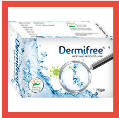
Ketoconazole Dermifree Antifungal Soap