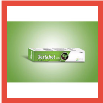
Sertaconazole Nitrate Cream