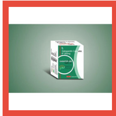
Gabapentin Capsules IP 300 mg