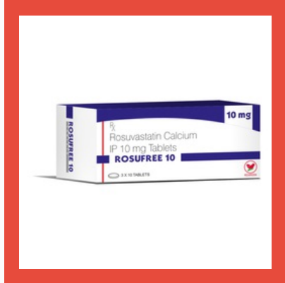
Rosuvastatin Calcium IP 10mg Tablets