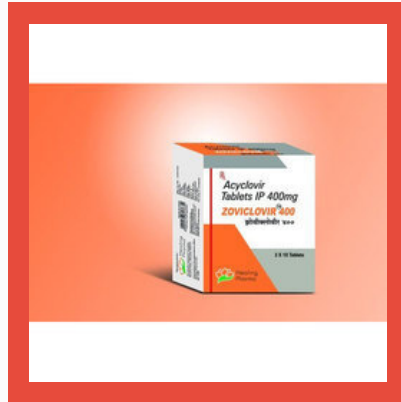
Acyclovir 400mg Tablet