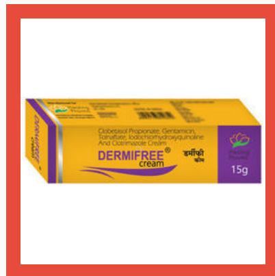
Clobetasol Propionate Gentamicin Tolnaftate Iodochlorhydroxyquinoline and Clotrimazole Cream