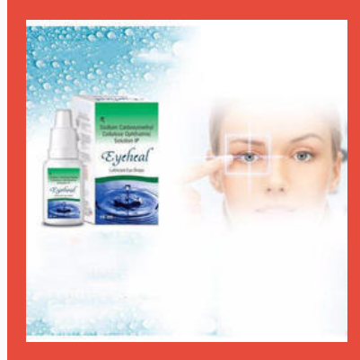
Sodium Carboxymethylcellulose Ophthalmic Solution IP