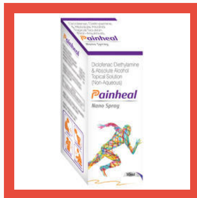
Painheal Nano Spray