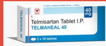
Telmaheal 40 (Telmisartan)