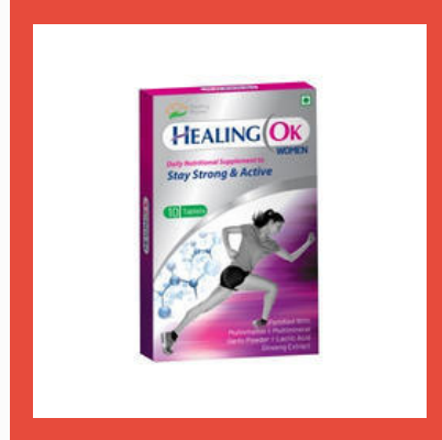
Healing Tablets for Women