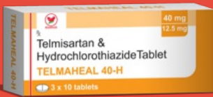
Telmaheal 40H(Telmisartan Hydrochlorthiazide)