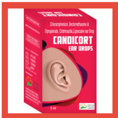
Chloramphenicol Beclomethasone & Dipropionate Clotrimazole Lignocaine Ear Drop