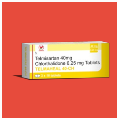
Telmaheal 40CH (telmisartan chlorthalidone)