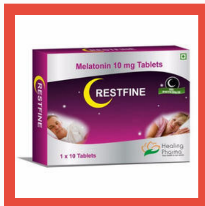
Restfine Melatonin Tablet