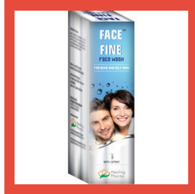
Face Fine Face Wash with Spray