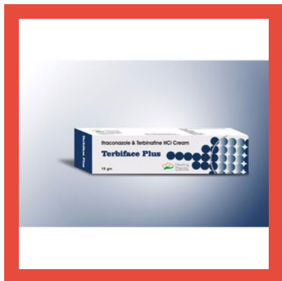
Itraconazole Terbinafine HCl Cream