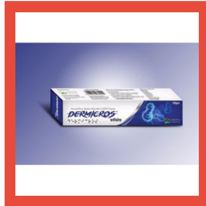
Amorolfine Hydrochloride Cream