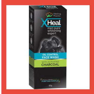
X- Heal Activated Charcoal Face Wash