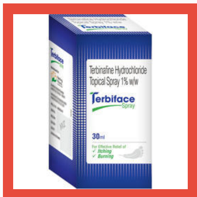
Terbiface Spray (Antifungal)