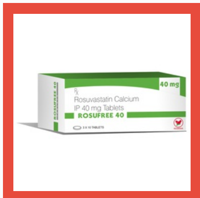
Rosuvastatin Calcium IP 40mg Tablets