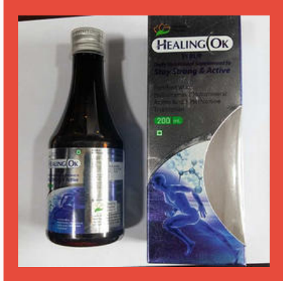
Healing Ok Syrup