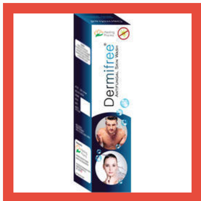
Dermifree Ketoconazole Skin Wash