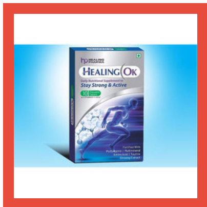
Healing Ok Tablet