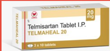
Telmaheal 20 (Telmisartan)